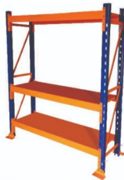
Heavy Duty Racking System