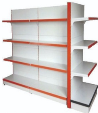
Display Rack / Super Market Rack