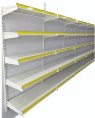
Wall Mounted Rack