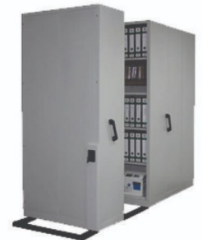
Compactor/Mobile Storage Systems

2, Hira Moti Appt. Nr. Bharat Dairy, Tithal Road, Valsad 📞 9925015595 🌐 laxmi.furniture@yahoo.com