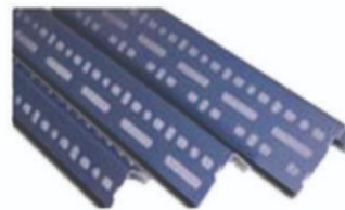
Slotted Angel Rack